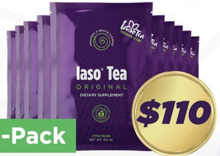
2nd Purchase to Sell

Total Investment $165 Total Earnings $490 Total Profit $325