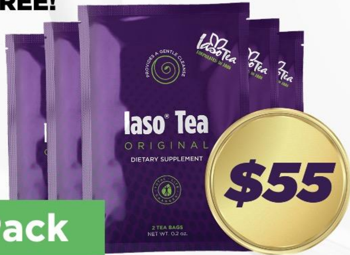
Example of Monthly Investment